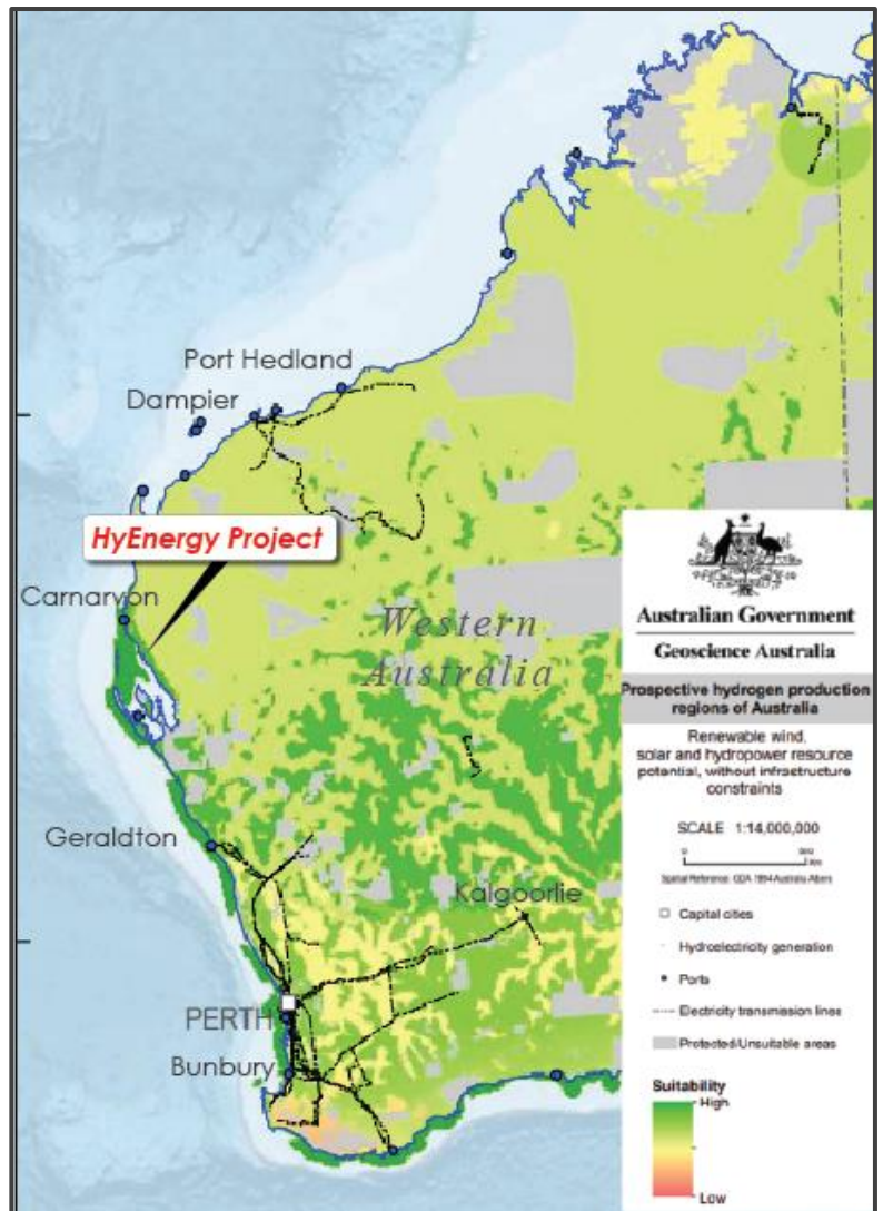
Figure 2. Location Map of HyEnergy Project highlighting highest suitability ranking by Geoscience Australia for prospective hydrogen production regions of Australia.