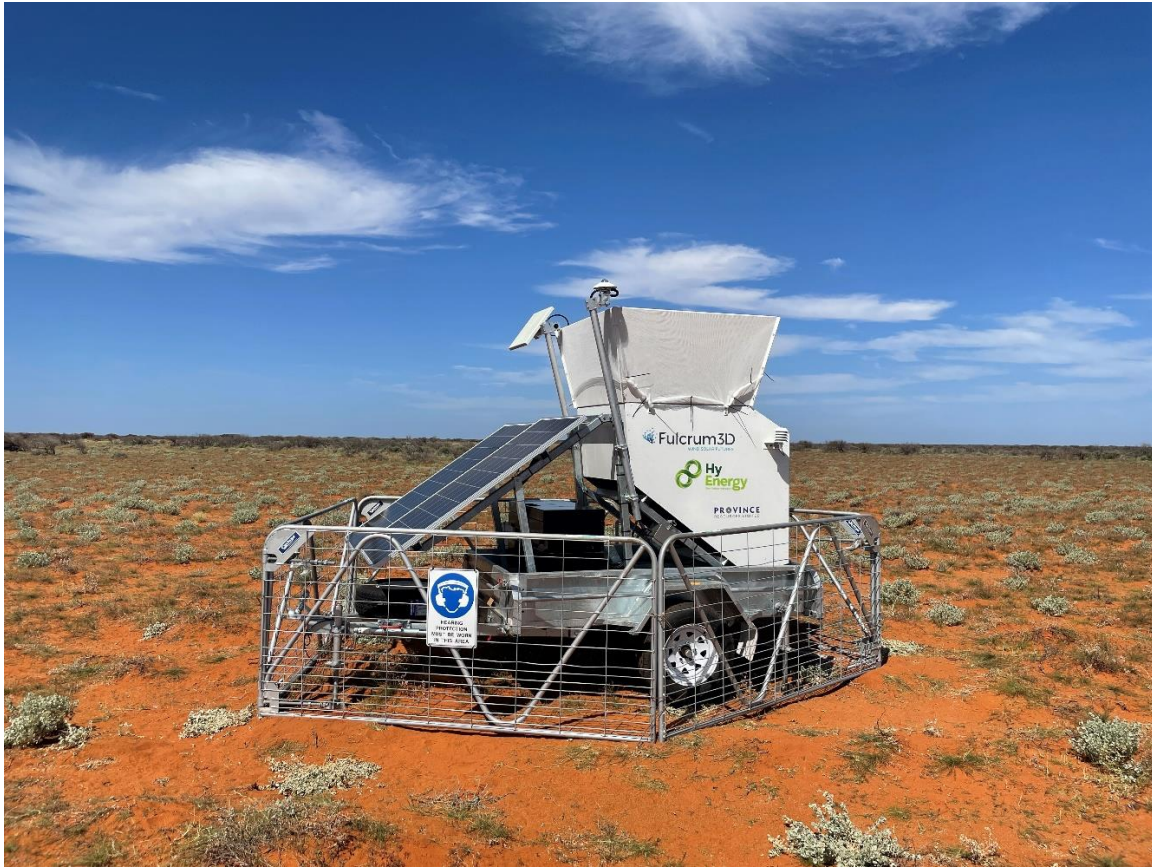
Figure 1. Fulcrum3D Sodar trailer mounted wind and solar monitoring station installed at the HyEnergy Project.